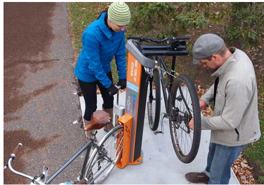
A Bike Fixation stand in action. (Photo: Bike Fixation)