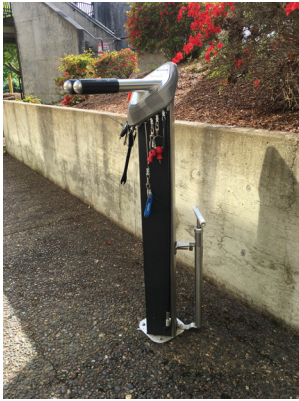
Bike Fix-It Station located at Washington County Service Center East

Bike Fix It Stations include all the tools necessary to perform basic bike repairs and maintenance, from changing a flat to adjusting brakes and derailleurs. Tools found on Bike Fix-It Stations include wrenches, screwdrivers, tire levers, an air pump, and a stand to hold a bicycle. You can hang the bike from the hanger arms allowing the pedals and wheels to spin freely while making any needed adjustments.